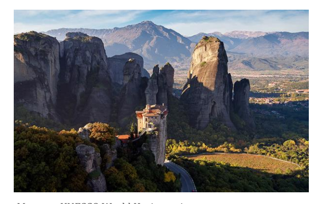
Meteora, UNESCO World Heritage site